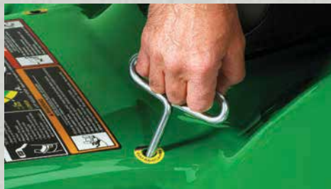
Exact Adjust Deck Leveling System. This exclusive feature allows you to conveniently level the deck from just below the seat.