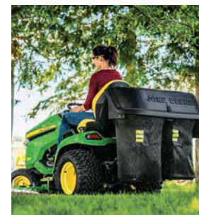
2-bag Power Flow Bagger