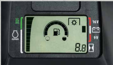
Easy-To-Read Display. Displays engine speed and target zone for the best cut quality.

Get a beautiful cut in a matter of minutes with the X380 lawn tractor. With the comfortable 18-in cut-and-sewn seat standard and optional 48- and 54-inch forged Accel Deep™ Mower Decks that cut clean, even passes at faster speeds. Add a Utility Cart to haul away most anything a lawn can throw at you.